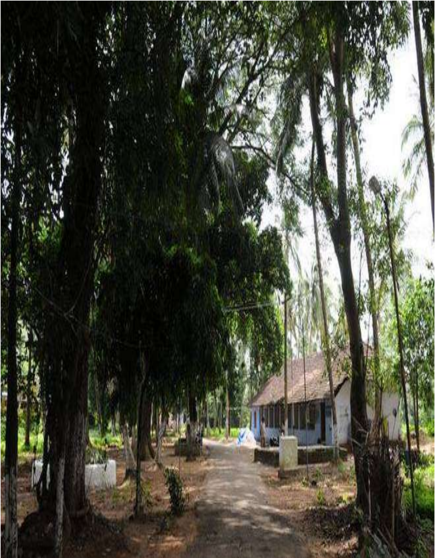
Sabari Ashram, Akathethara Panchayat, Palakkad